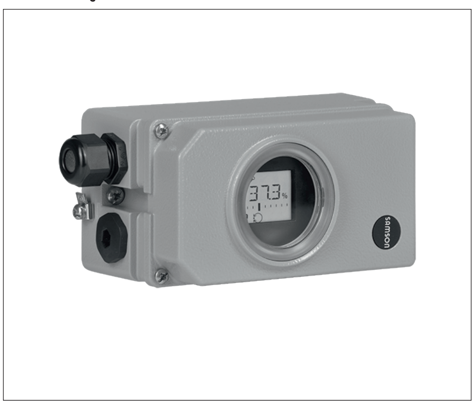
Type 3730-1 Electropneumatic Positioner